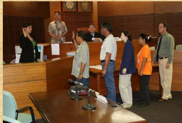
Chuukese interpreter being sworn in.

The Judiciary of Guam seeks to improve interpreter services and administration by certifying court intpreters for non-English speaking persons. A planning group, in partnership with the University of Guam, has been formed to develop a formal court interpreter training/certification program to address current and long term needs. This will improve court services and ensure equal access to justice and court services.